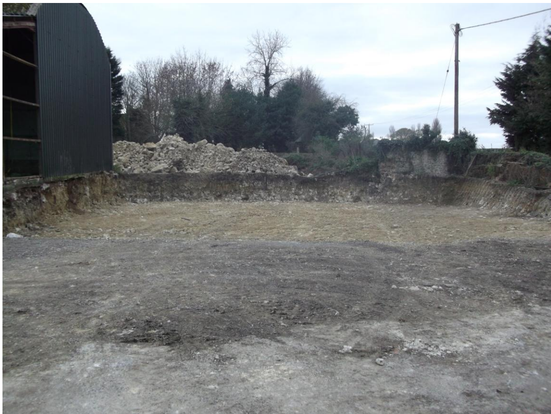
Plate 1. Showing removal of made-up ground (south-west)