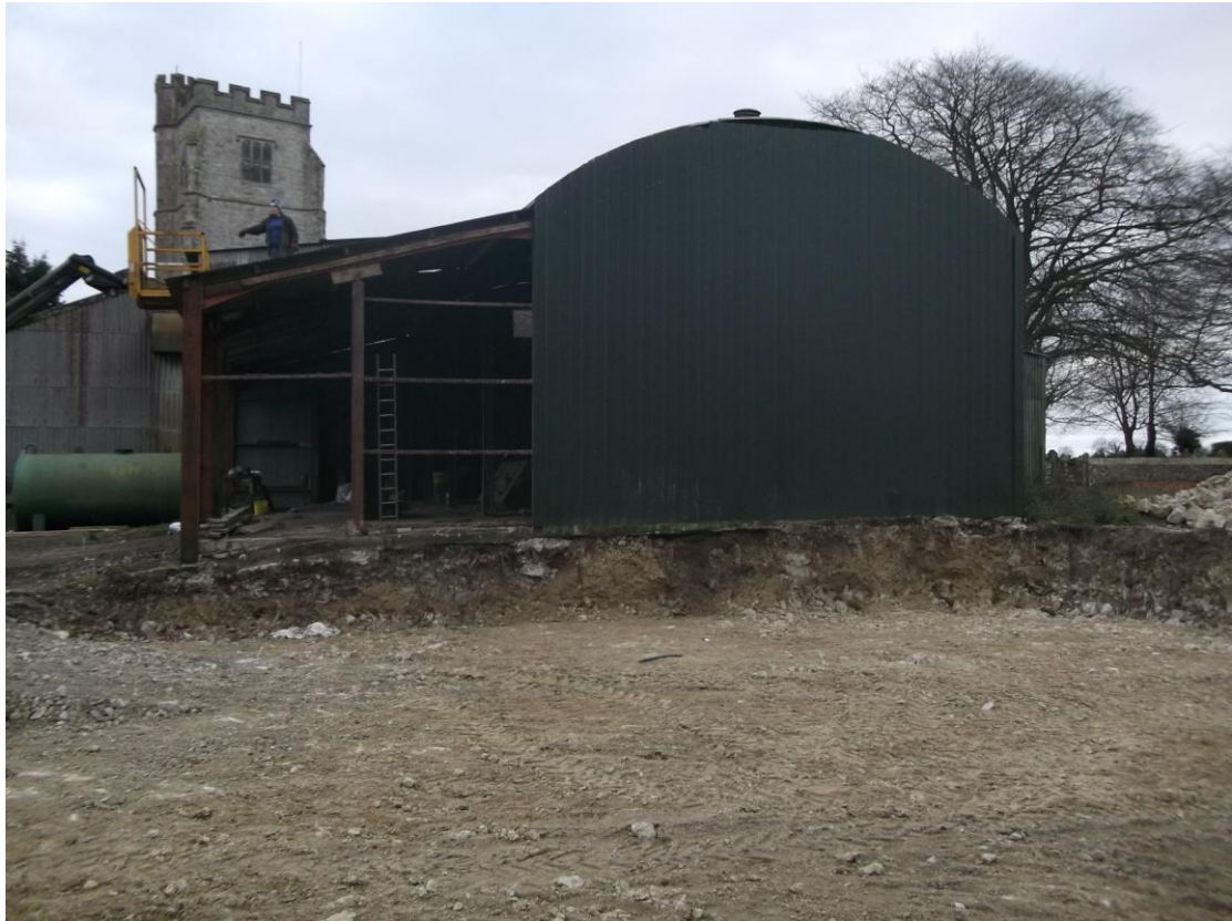
Plate 2. Showing view towards the church (south-east)